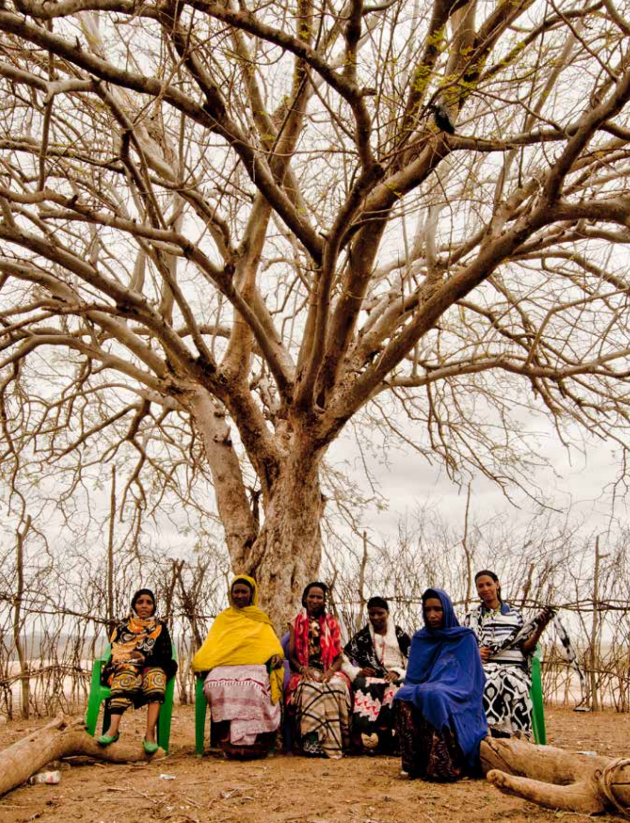
Displaced women seated under a tree in Ethiopia, where drought exacerbated by climate change is affecting hundreds of thousands of people.