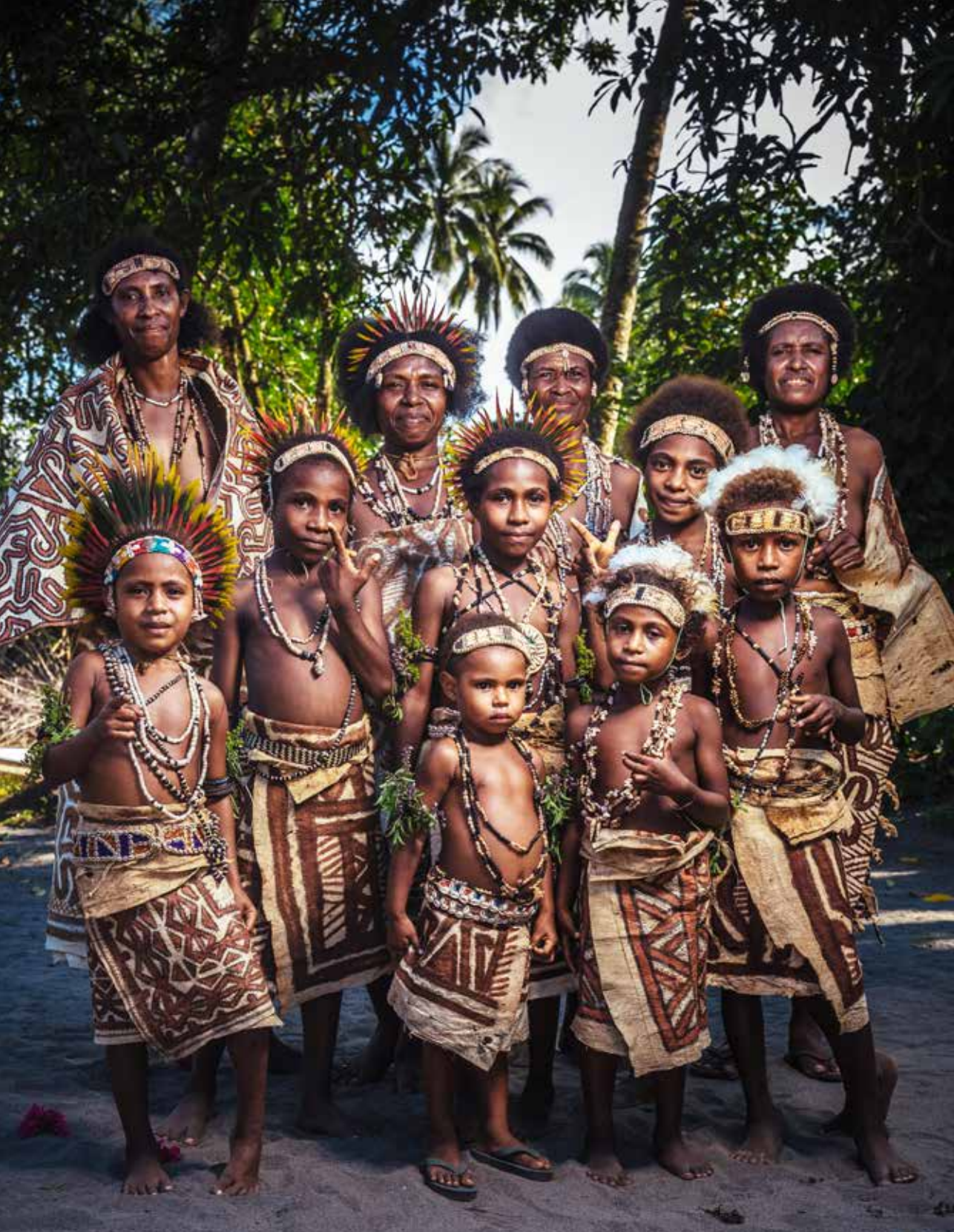
Children in their traditional clothing in Killerton, Papua New Guinea, where climate change is changing the landscape.