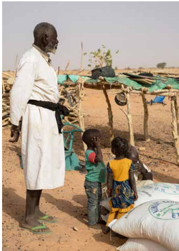
Due to a major drought in 2017 in Mauritania, people in the Hodh El Chargui region are receiving humanitarian assistance, including livestock feed supplies.

However, it is also important to acknowledge that migration can be part of a positive, life-saving strategy when planned and well-managed. For instance, it allows people to cope with the impacts of environmental degradation, open new avenues for livelihood diversification and can encourage the contributions of migrants and diasporas to climate change action in their places of origin.