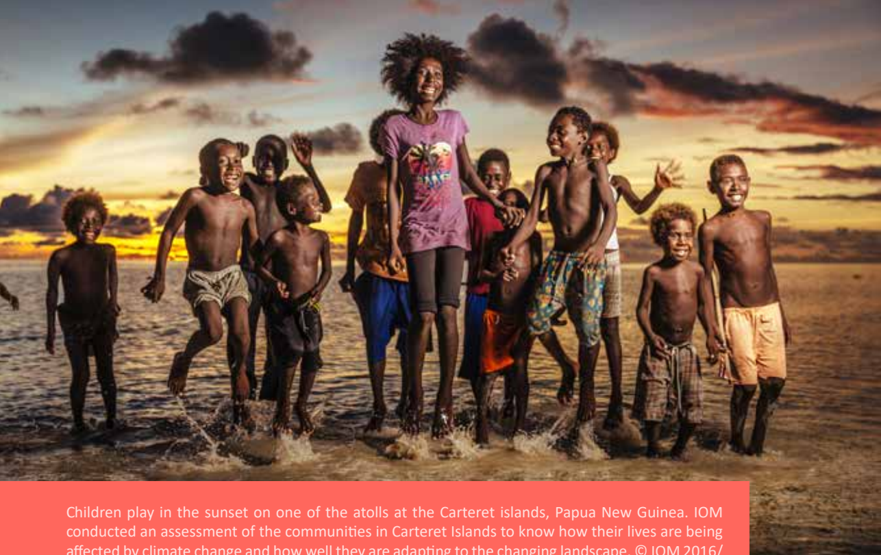
Children play in the sunset on one of the atolls at the Carteret islands, Papua New Guinea. IOM conducted an assessment of the communities in Carteret Islands to know how their lives are being affected by climate change and how well they are adapting to the changing landscape.