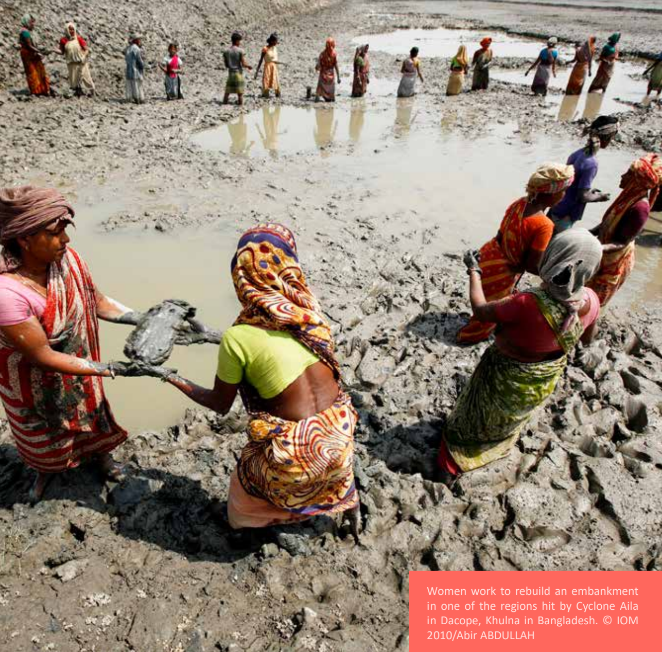
Women work to rebuild an embankment in one of the regions hit by Cyclone Aila in Dacope, Khulna in Bangladesh.

In Ethiopia and Uganda, the deterioration of pastures due to land degradation and desertification have forced pastoralists to migrate hundreds of kilometres away in search of better pastures. In Burkina Faso, desertification has also been identified as a driver of migration, and many urban centres see the arrival of vast numbers of migrants. The swelling population in city centres will continue to put additional strain on already stretched public infrastructure, especially water and sanitation provision.