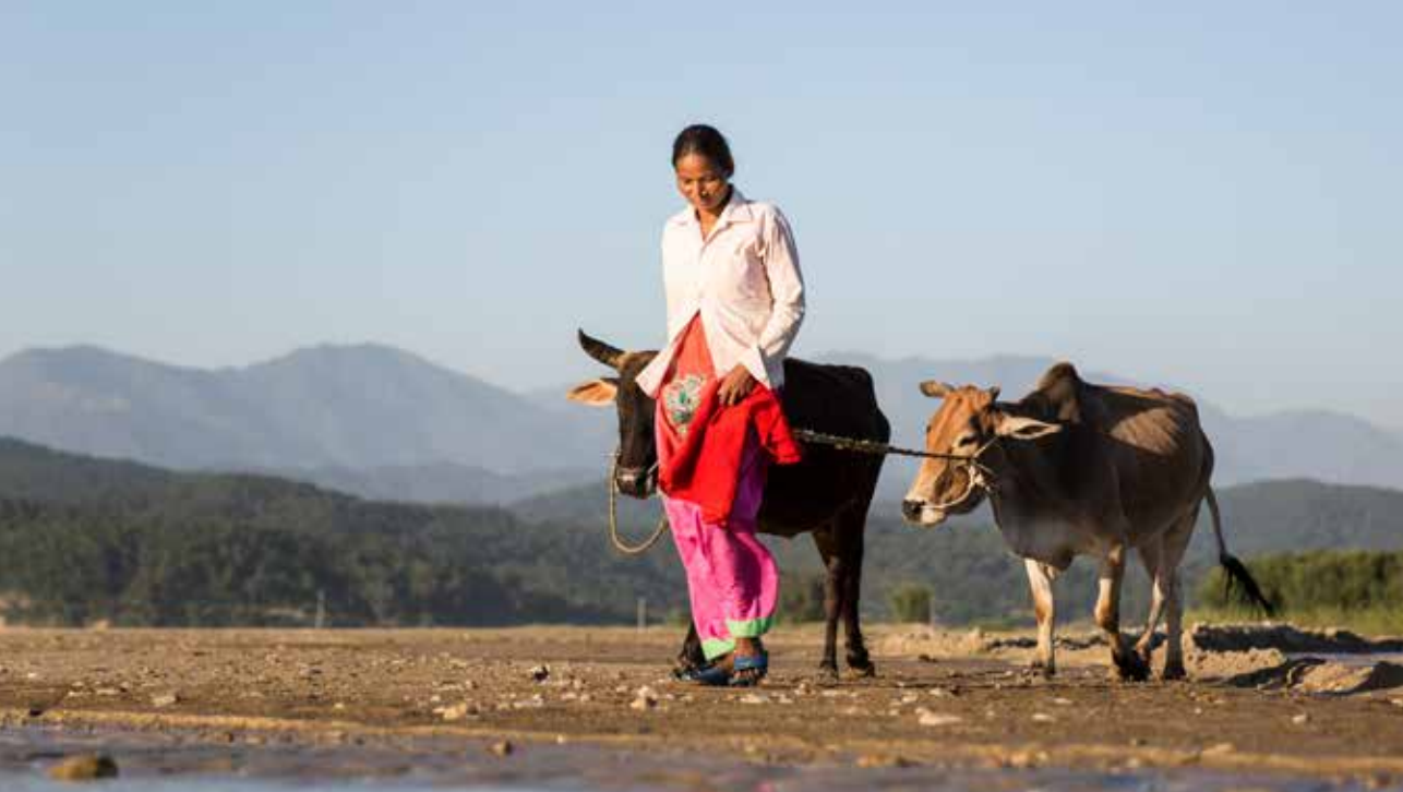
Woman crossing river during the dry season in Nepal. Due to sedimentation in the Udaipur region, intensified by the heavy rains and deforestation, rivers are becoming shallower and broader, contributing to floods during monsoon.

While migration linked directly or indirectly to environmental degradation and climate change are a daily reality, there are vulnerable segments of population in LDCs, such as many women, children, elderly, disabled and indigenous people, who are unable to move in the face of calamities and are trapped in desolate environments. LDCs are still struggling to foster high productivity activities in the manufacturing and specialized sectors that are crucial for structural transformation. Therefore, they have limited institutional capacity and financial resources to build resilience against climate stress, and cope with